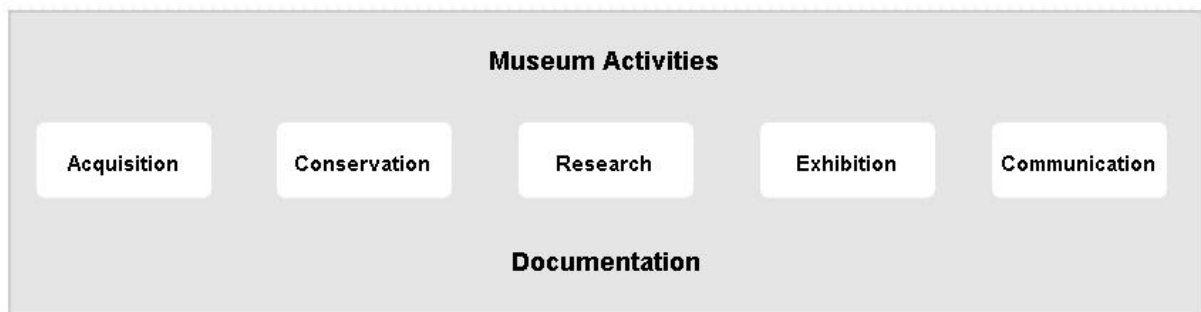
Fig 2: Documentation interlocking the activities in the museum

A well-maintained and up-to-date documentation is an investment in the future and can be used for a wide range of tasks inside the museum as described above. In this way, it forms the basis for all sectors of museum work mentioned in the ICOM definition of museum, and what is more, it basically encloses these tasks and interlocks the different working fields in the museum as is shown in figure 2.